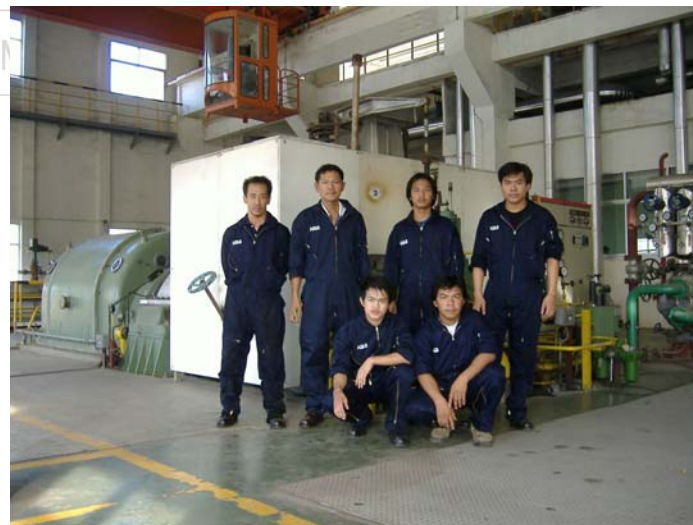
Major overhauling steam turbine generator 7500 kW. Of United paper.