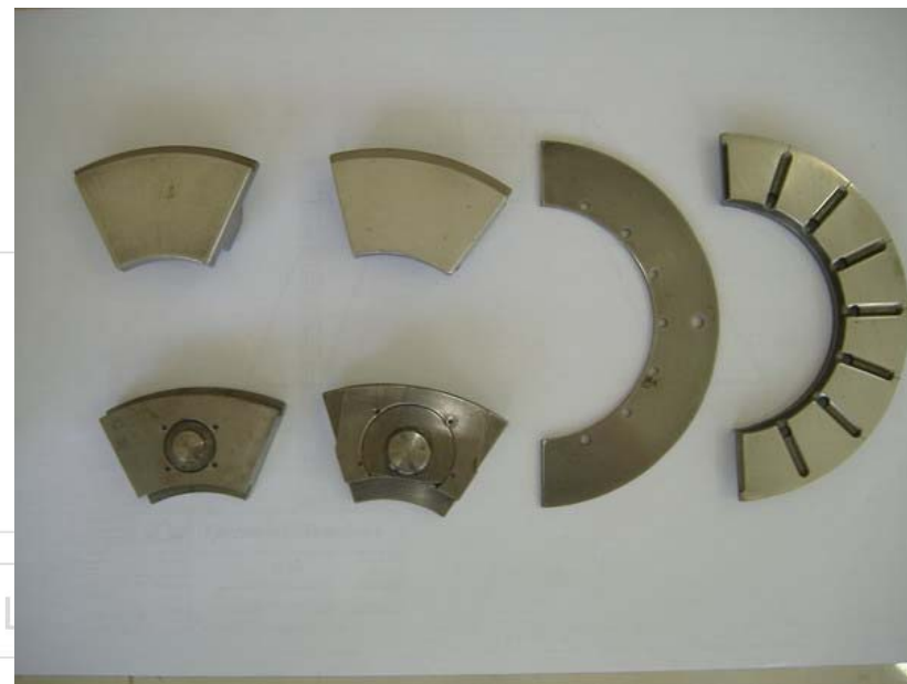
Thrust pad bearing