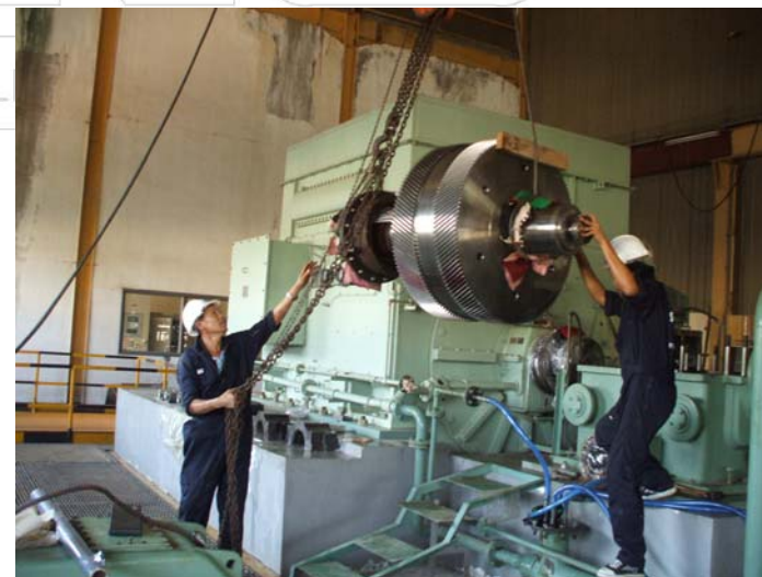
Inspection and overhaul reduction gear at Cambodia.