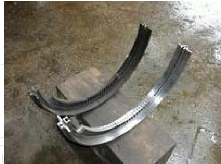
Before and after build up nozzle ring steam turbine generator 1500 kW. Of Cholburi sugar mill.