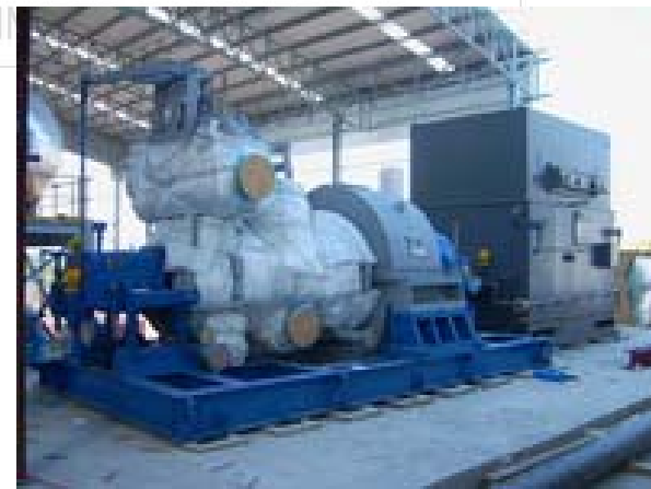
Steam turbine generator 9900 kW. Installation of Kaona power supply.