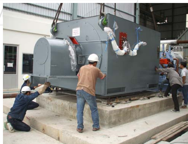
Steam turbine generator 8000 kW. Installation of Kaona power supply.