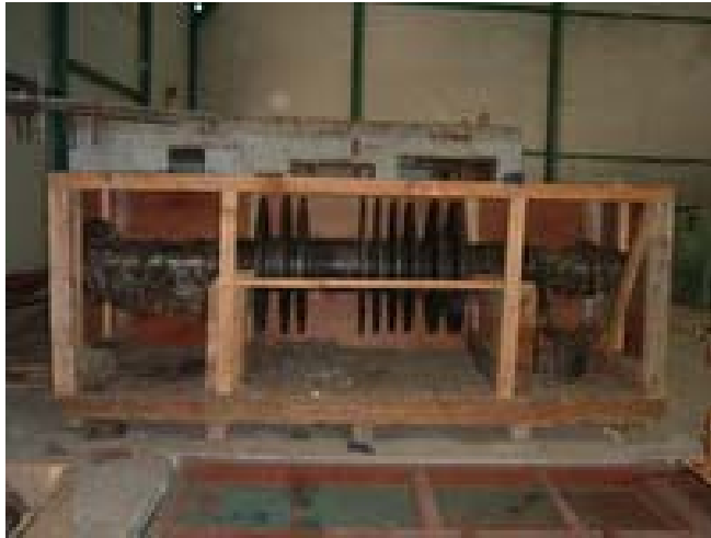
Steam turbine rotor 15000 kW.