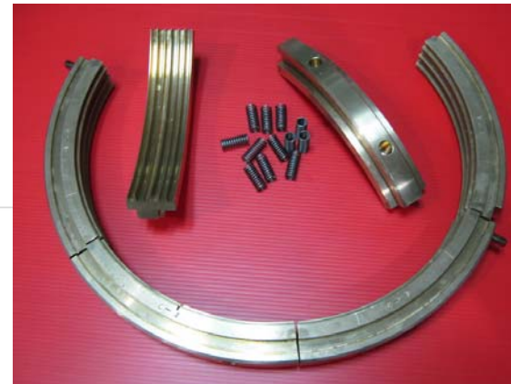
Labyrinth gland seal