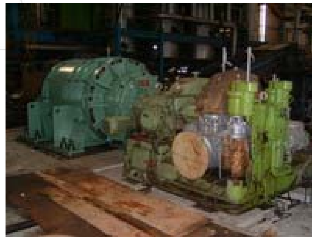
Planetary gear installation of Pranburi sugar mill.