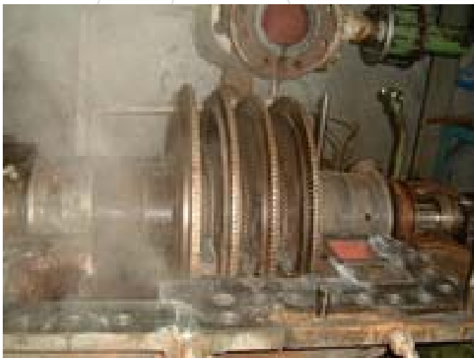
Overhauling steam turbine generator 3500 kW. Of Chumporn palm oil.