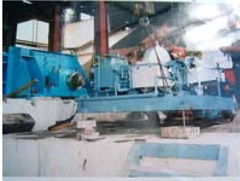
Steam turbine 700 Hp. Of Maewang sugar mill.