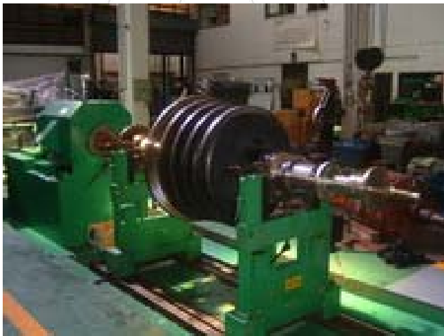
Balancing steam turbine rotor 12000 kW.