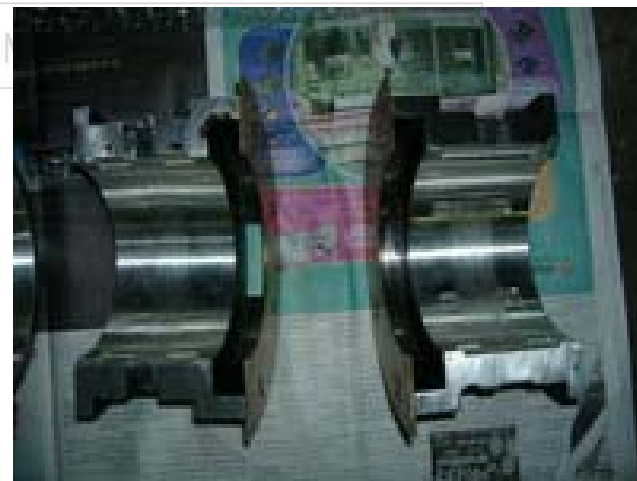
Re-Babbitt sleeve bearing of reduction gear