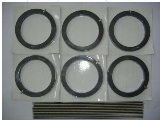
Carbon ring gland seal