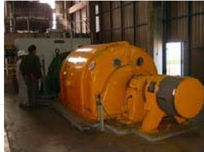
Steam turbine generator 6000 kW. Made in China.