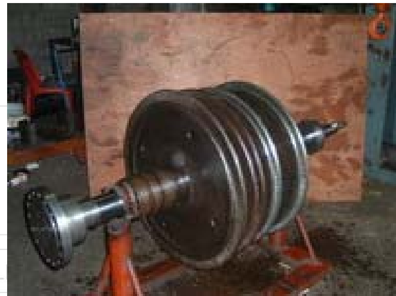
Replace rotor blade steam turbine Generator 3200 kW. Of Newkwangsunlee suger mill.