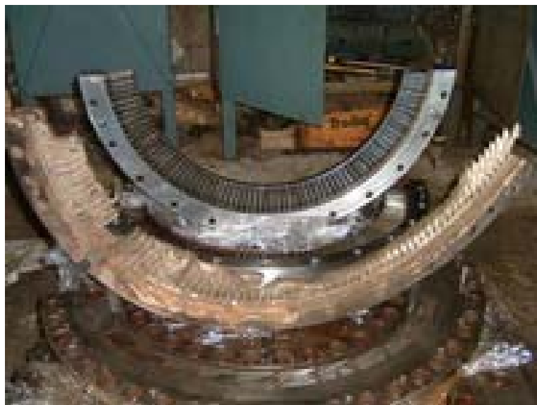
Before and after build up nozzle ring.