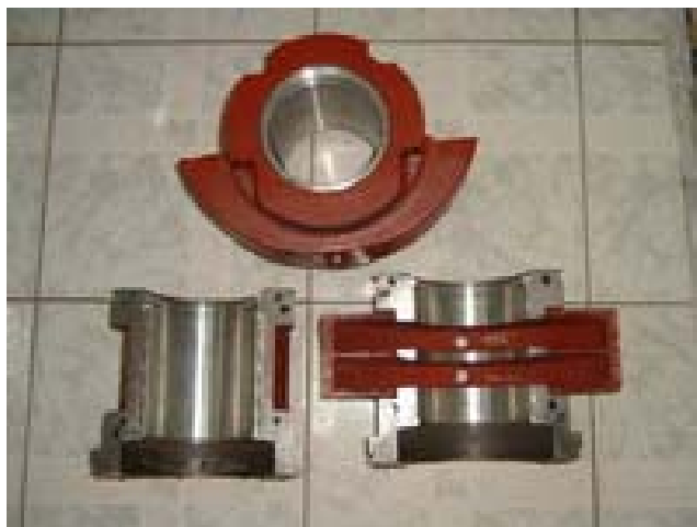
Re-Babbitt sleeve bearing of motor