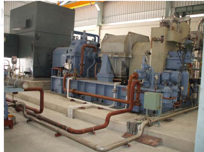
Steam turbine generator 8000 kW. Made in India.