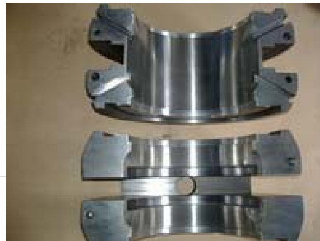
Re-Babbitt sleeve bearing of generator