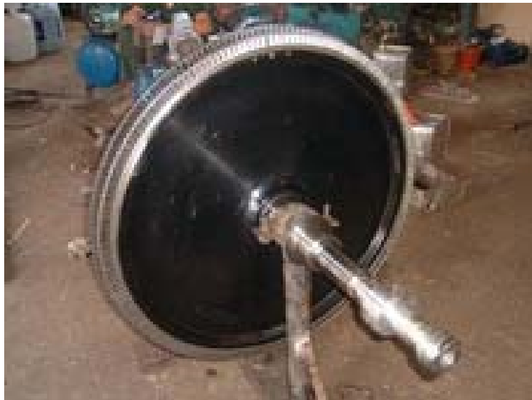
Replace rotor blade steam turbine 2000 Hp. Of E-saan sugar mill.