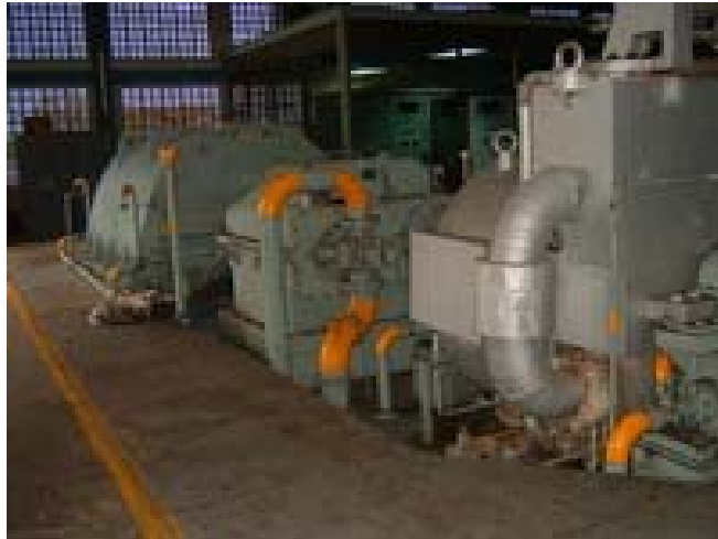
Steam turbine generator 12500 kW. Made in Japan.