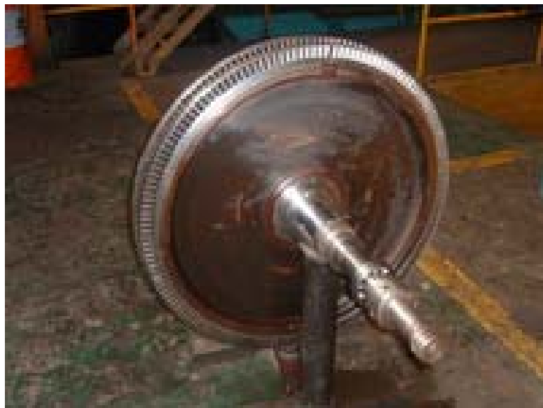
Replace rotor blade steam turbine 1500 Hp. Of Thaipermpoon suger mill.