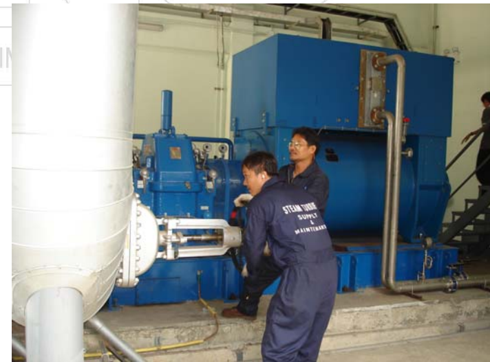
Commissioning steam turbine generator 2760 kW. Of CGC Power plant.