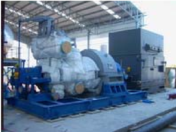
Steam turbine generator 9900 kW. Made in Brazil.