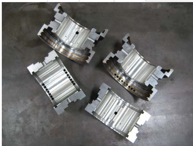
New sleeve bearing of turbine