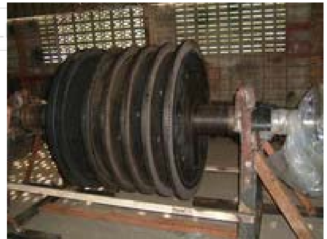
Steam turbine rotor 6000 kW.