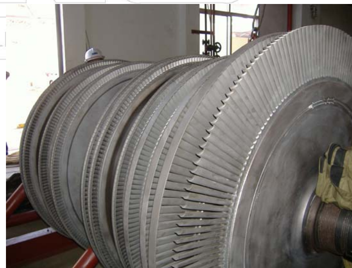
Turbine rotor glass bead blasting cleaning preparation.