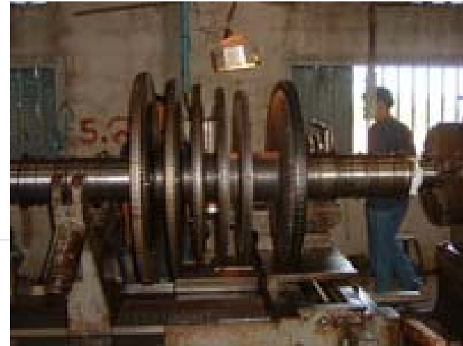
Steam turbine rotor 12500 kW.