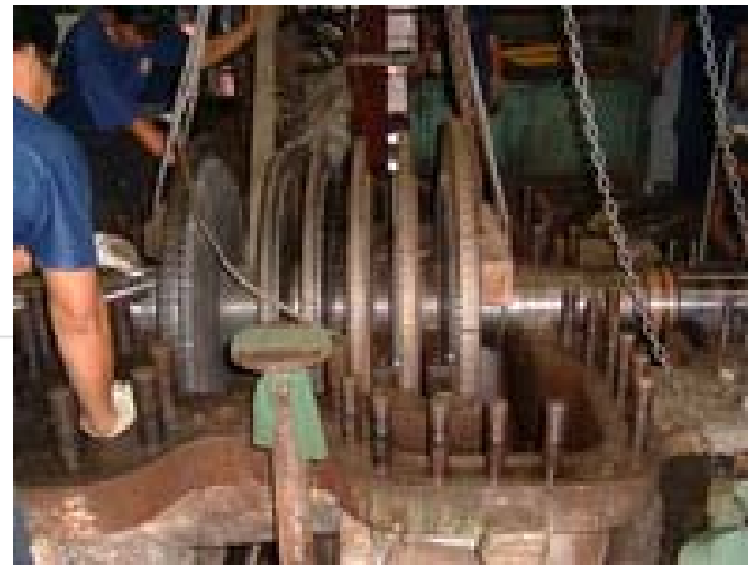
Overhauling steam turbine generator 12500 kW. Of Thaipermpon sugar mill.