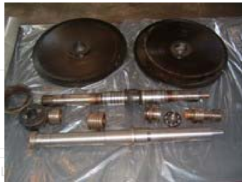
Before and after build up rotor shaft.